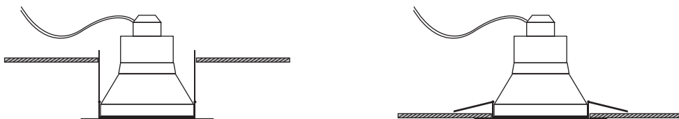
DIAGRAM ILLUSTRATING HOW TO INSTALL THE FITTING INTO THE CEILING

Should you need to remove the unit, switch off at the mains. Grip the inside of the downlighter and pull downwards. Replacement is as instructed above under FITTING.